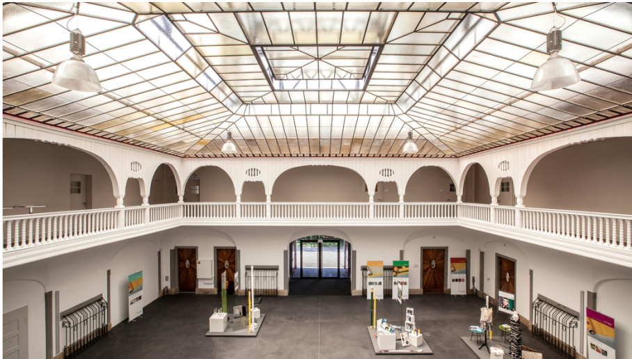
Sefar Competence & Training Center, Screen Printing

The intensive screen printing course covers a wide range of topics, from mesh selection and its impact on the print result, to the intricacies of the stretching process and how to optimize the printing process.