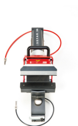
SEFAR 3A / 150