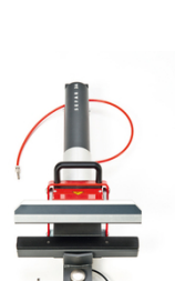
SEFAR 3A L/250