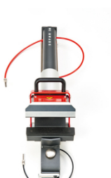
SEFAR 3A L/150