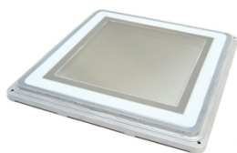
Trampoline Mounted Screen