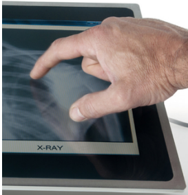
Whether edge masking or protective coatings using SEFAR PME (© Danielson Europe BV)