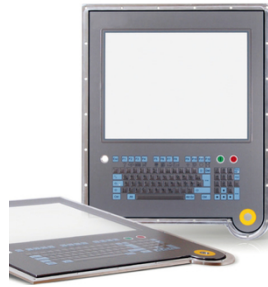
Clear and durable signs and inscriptions printed with SEFAR PME (© Danielson Europe BV)