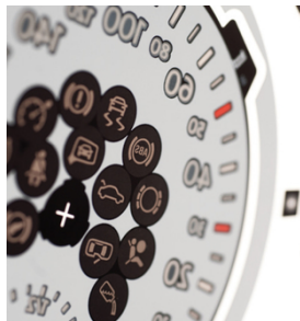
In the fast lane with the highest efficiency and quality printed with SEFAR PME