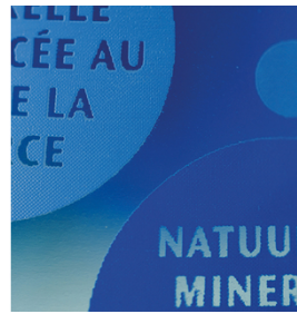
Brilliant colors and crisp print edges with UV inks. Printed with SEFAR PCF 120/305-34Y