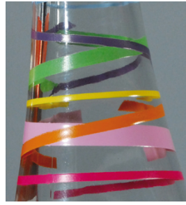
High density and sharp contours with SEFAR PA