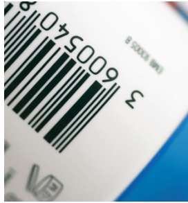
High density sharp edged bar codes printed with SEFAR PA