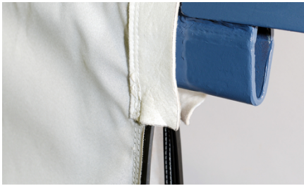
Optimal sealing design