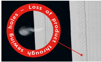
No product loss using Sefar welding technology (no sewing holes)

Sefar has developed dedicated yarns and filter media to withstand strong alkaline process conditions at operating temperatures up to 110 degrees Celsius. Our multichannel bags feature highly uniform dimensions thanks to an automated fabrication process from cutting to welding and channel sewing on a special sewing automate. Special thread is used for sewing and a highest-class fabric allows for smooth installation and perfect tightness on the collector.