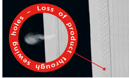
No product loss using Sefar welding technology (no sewing holes)

Sefar has developed dedicated yarns and filter media to withstand strong alkaline process conditions at operating temperatures up to 110 degrees Celsius. Our multichannel bags feature highly uniform dimensions thanks to an automated fabrication process from cutting to welding and channel sewing on a special sewing automate. Special thread is used for sewing and a highest-class fabric allows for smooth installation and perfect tightness on the collector.